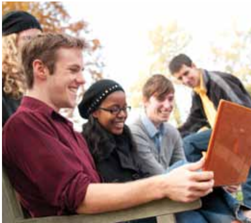
With 2,000+ students, Undergraduate Studies is an important part of Regent's plan for future growth.

In an effort to define more clearly what sets RSU apart inside and outside the university, Moreno-Riaño spearheaded a five-month effort to develop and adopt a description and justification for Regent’s undergraduate school: “It was a tremendous accomplishment,” he explains. “Within a very short period of time ... faculty and staff collaborated to identify the key